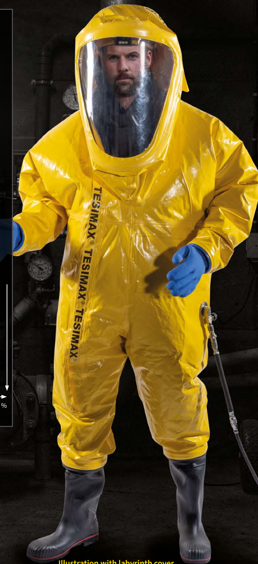
Illustration with labyrinth cover